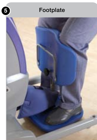
5 Footplate The footplate provides safety and stability, while the Pro-Active Pad allows natural flexion of the ankle.