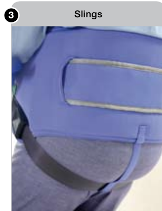
3 Slings Supporting a more upright standing position makes the BOS/EPS sling ideal for rehabilitation.