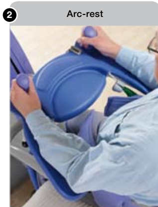
2 Arc-rest The Arc-Rest offers excellent support and promotes a sense of security.