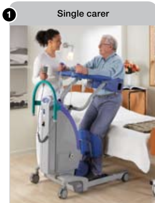
1 Single carer A single carer can manage transfers, safely and efficiently.