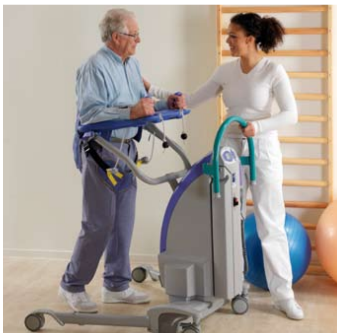
Enables stepping and walking exercises, which enhance mobility benefits.