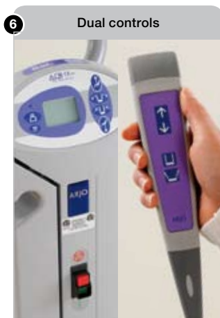
6 Dual controls Handset or mast panel control? The carer can choose the most convenient control according to the situation.